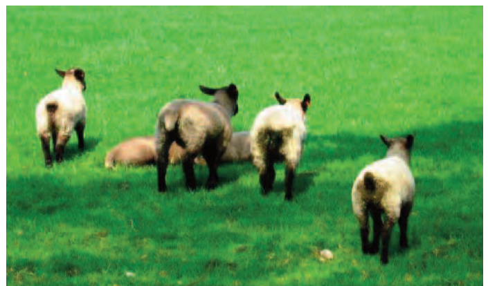
Scour in lambs during June, maybe caused by internal parasites, principally Nematodirus and Teladorsagia. If the problem is not addressed, this may lead to losses and long-term poor growth rates.

Endoparasites cost the UK sheep industry £84m annually and the problem of anthelmintic resistance is increasing. Recent research (Gerald Colles 2010) suggests that only 15% of farmers understand the SCOPS recommendations. NADIS publishes a monthly parasite forecast based on detailed Met Office data for the 10 weather regions of the UK. The Parasite Forecast highlights the likely parasitic challenge to livestock in the regions and emphasises the SCOPS recommendations in a practical context. Specific forecasts are published for fluke and nematodiosis at strategic times of the year