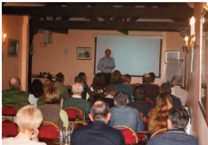
Seminars have average attendances of over 30 across all the RDA regions

The training has covered the key livestock species. As the programme has developed a veterinary based animal health resource has been produced, covering all the conditions that affect UK livestock, providing a unique training resource for livestock keepers.