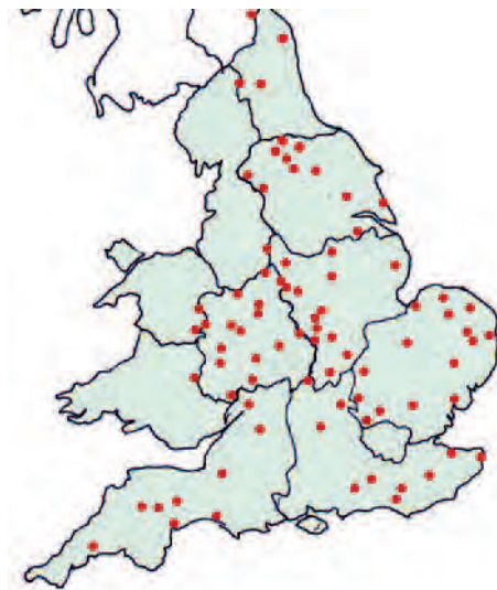
Distribution of practices delivering NADIS knowledge transfer training

The training has covered the key livestock species. As the programme has developed a veterinary based animal health resource has been produced, covering all the conditions that affect UK livestock, providing a unique training resource for livestock keepers.